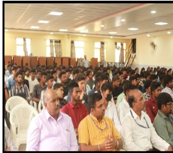
National Level Workshop on Python Programming