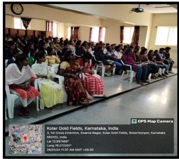
Seminar on Recent Trends in Finance