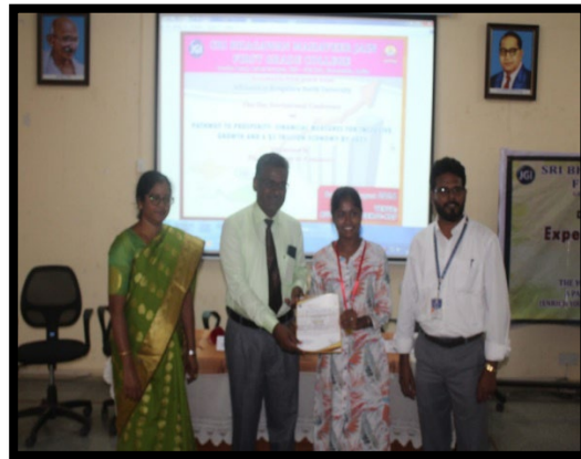
One-Day International Conference on “Pathway to Prosperity: Financial Measures for Inclusive Growth and A $5 Trillion Economy by 2025