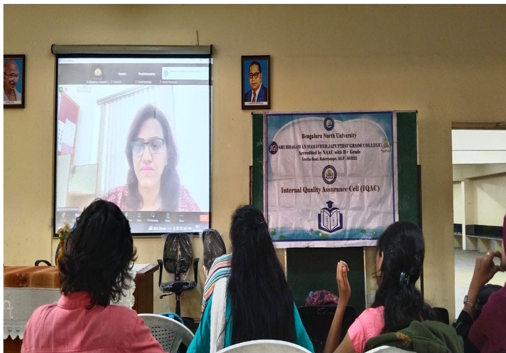
Webinar on career opportunities and employability skills by Kirloskar