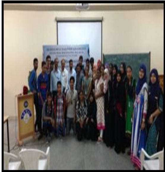
National Level Workshop on Entrepreneurship Skill Attitude and Behaviour Development