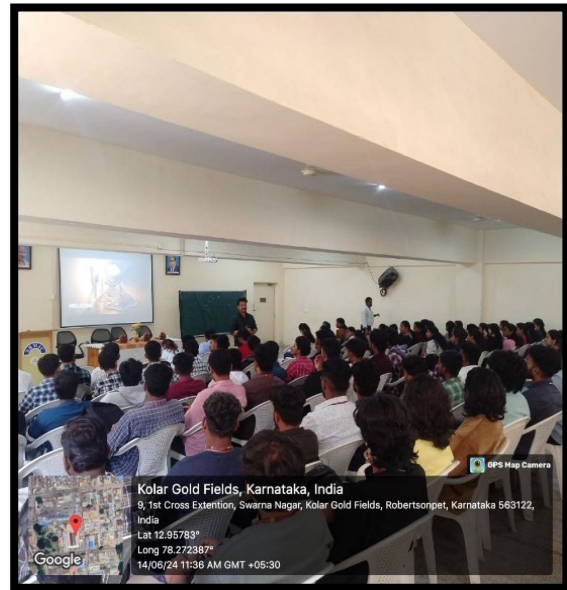
Workshop on Cyber Security and Ethical Hacking