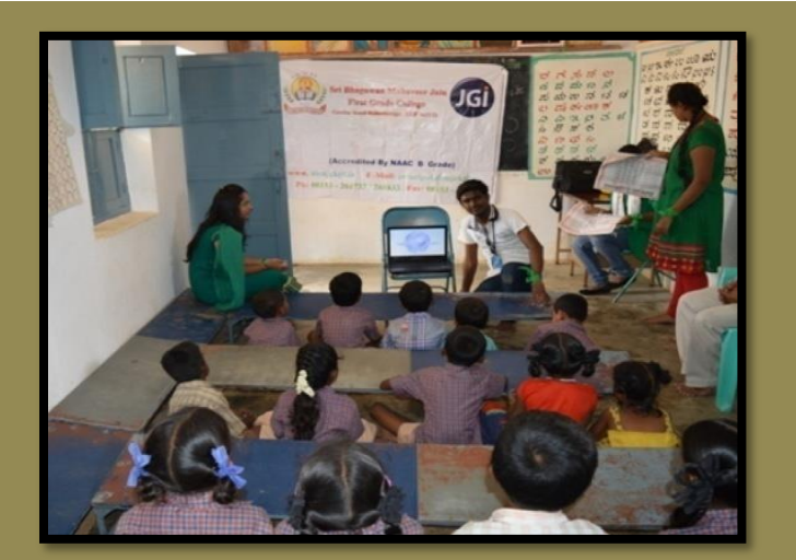
Awareness Programme on importance of trees also students planted saplings in the schools